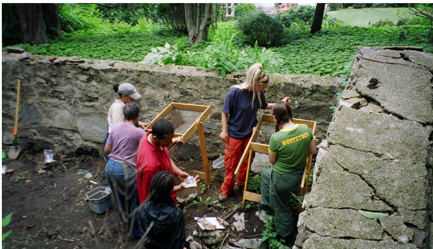
Students and volunteers excavate a possible underground railroad site on Ladder Hill Road in Western, CT.

ALAADS has a future vision of various collaborations with historically focused museums such as the Mattatuck Museum and Community for Change for the Arts (CFCFA). By working with CFCFA, the ALAADS's staff hopes to develop a museum of African (Concluded on page 11)