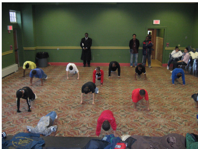
Children work out their bodies as well as their minds at the NAACP sponsored workshop in the Fall to Spring Semesters at Central Connecticut State University.